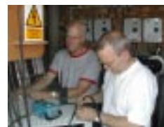
Hammers are Us!